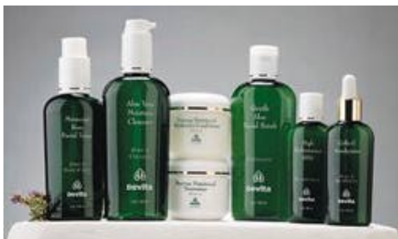
Devita Natural Skin Care Systems is pictured above. Devita is just one of the top chemical-free brands we offer.

By transitioning to all-natural skin care and cos-